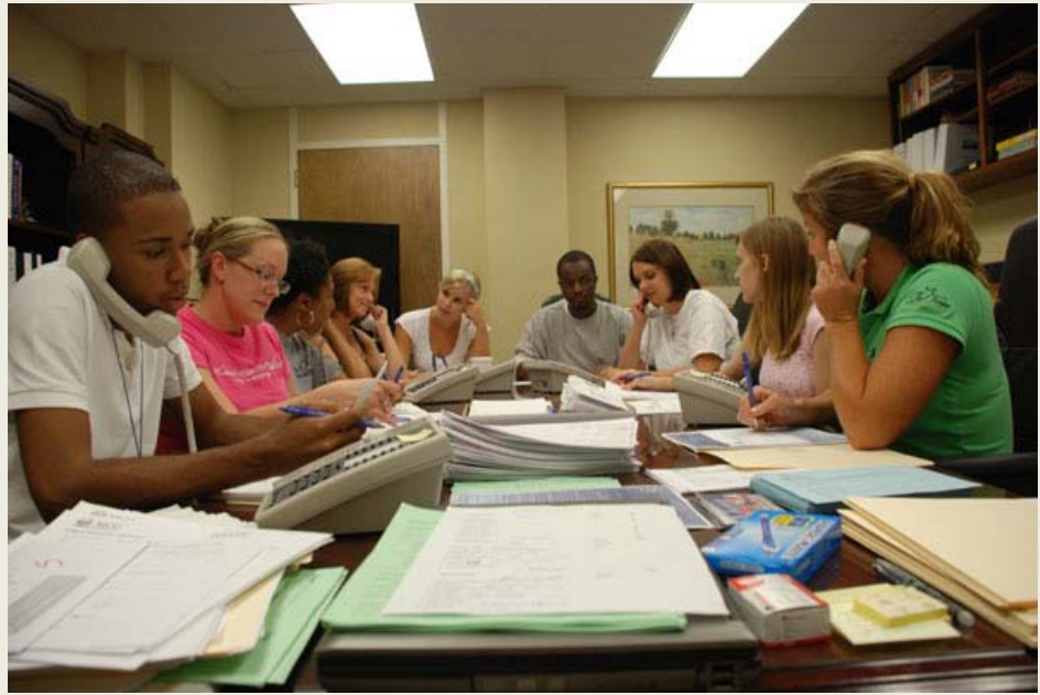
Dental Hygiene students from the class of 2010, volunteering during a three night phonathon to help raise funds for the school of dentistry building initiative.

The initial meeting of the committee was held on Wednesday, August 12, at which time the members were formally charged with their roles and responsibilities in conducting the search.